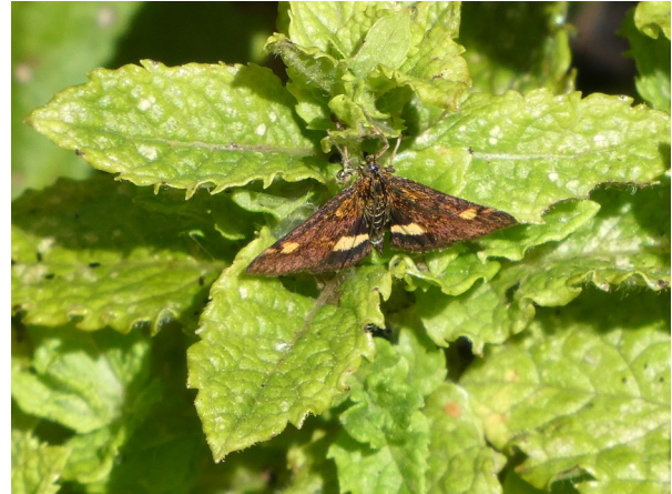
Mint moth